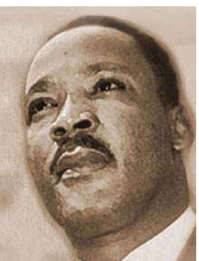
Martin Luther King Jr. Day January 16

"The ultimate measure of a man is not where he stands in moments of comfort and convenience, but where he stands at times of challenge and controversy."